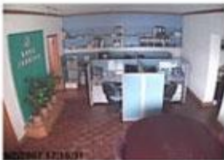
Day Time View