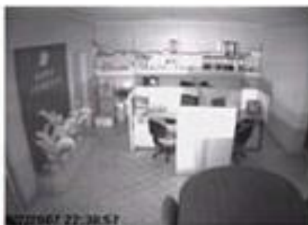
Night Time View Lens 3.6 mm